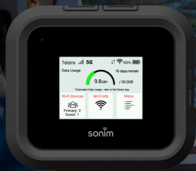
sonim H700 5G Mobile Hotspot